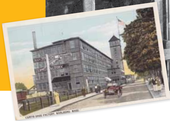
Curtis Shoe Factory postcard circa 1900's.