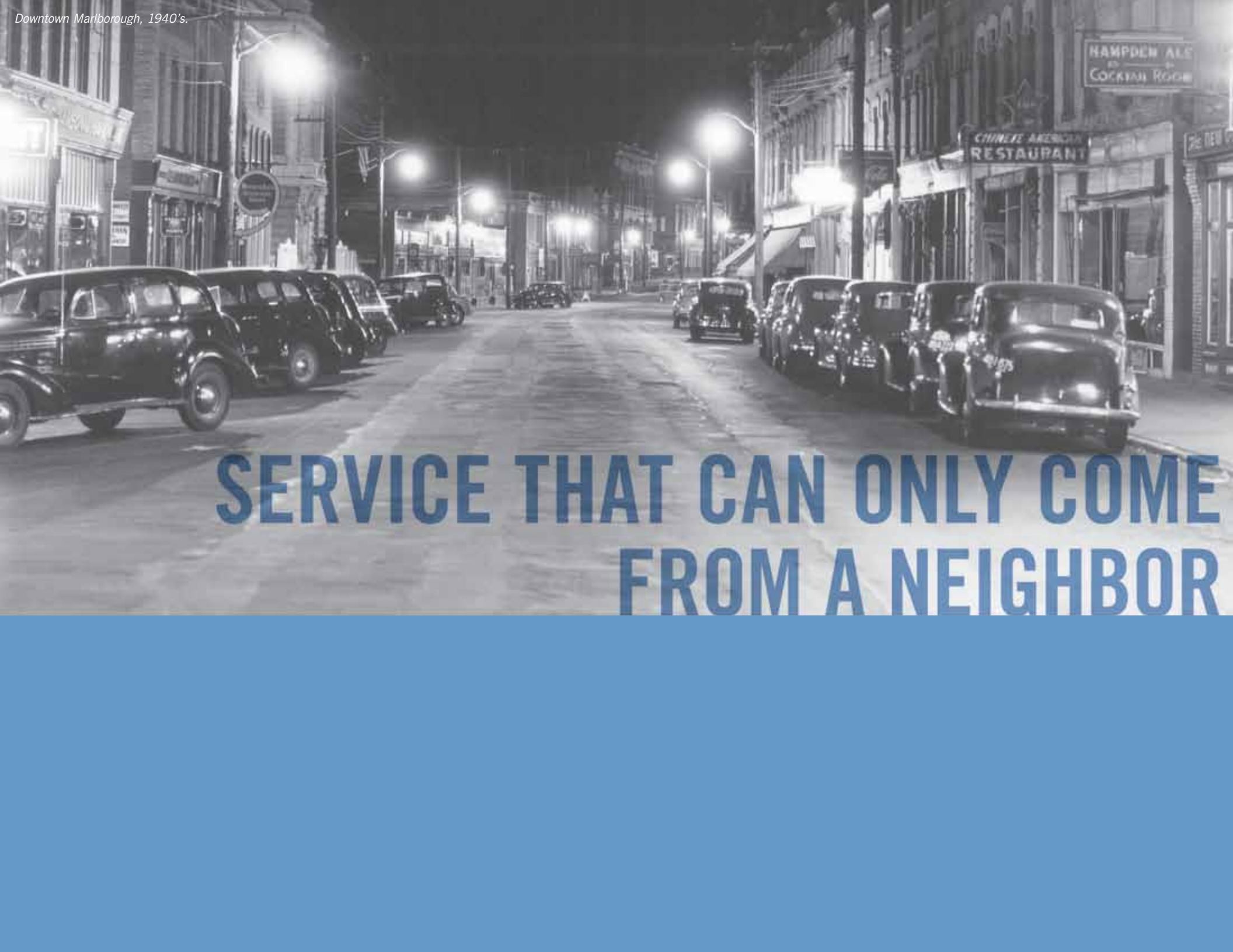
Downtown Marlborough, 1940's.

SERVICE THAT CAN ONLY COME FROM A NEIGHBOR