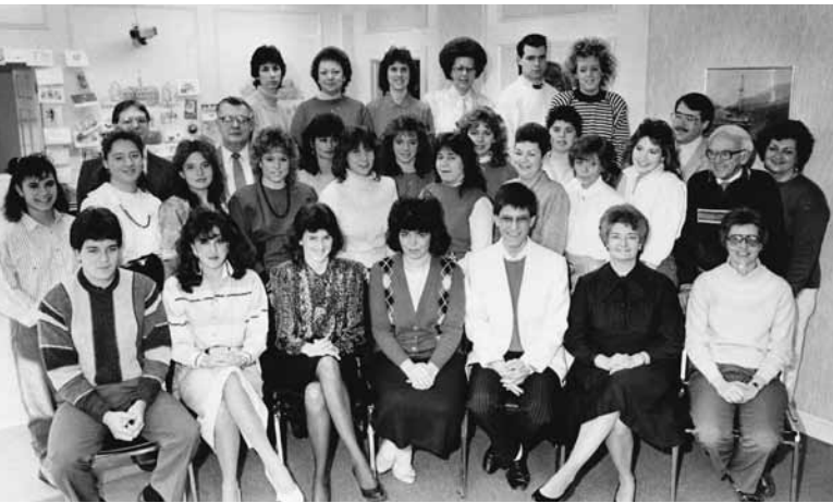
St. Mary's Credit Union staff 1988-1989.

By 2005, St. Mary's Credit Union was serving more than 30,000 members in several communities and, as a result, expanded into Hudson and Northborough.