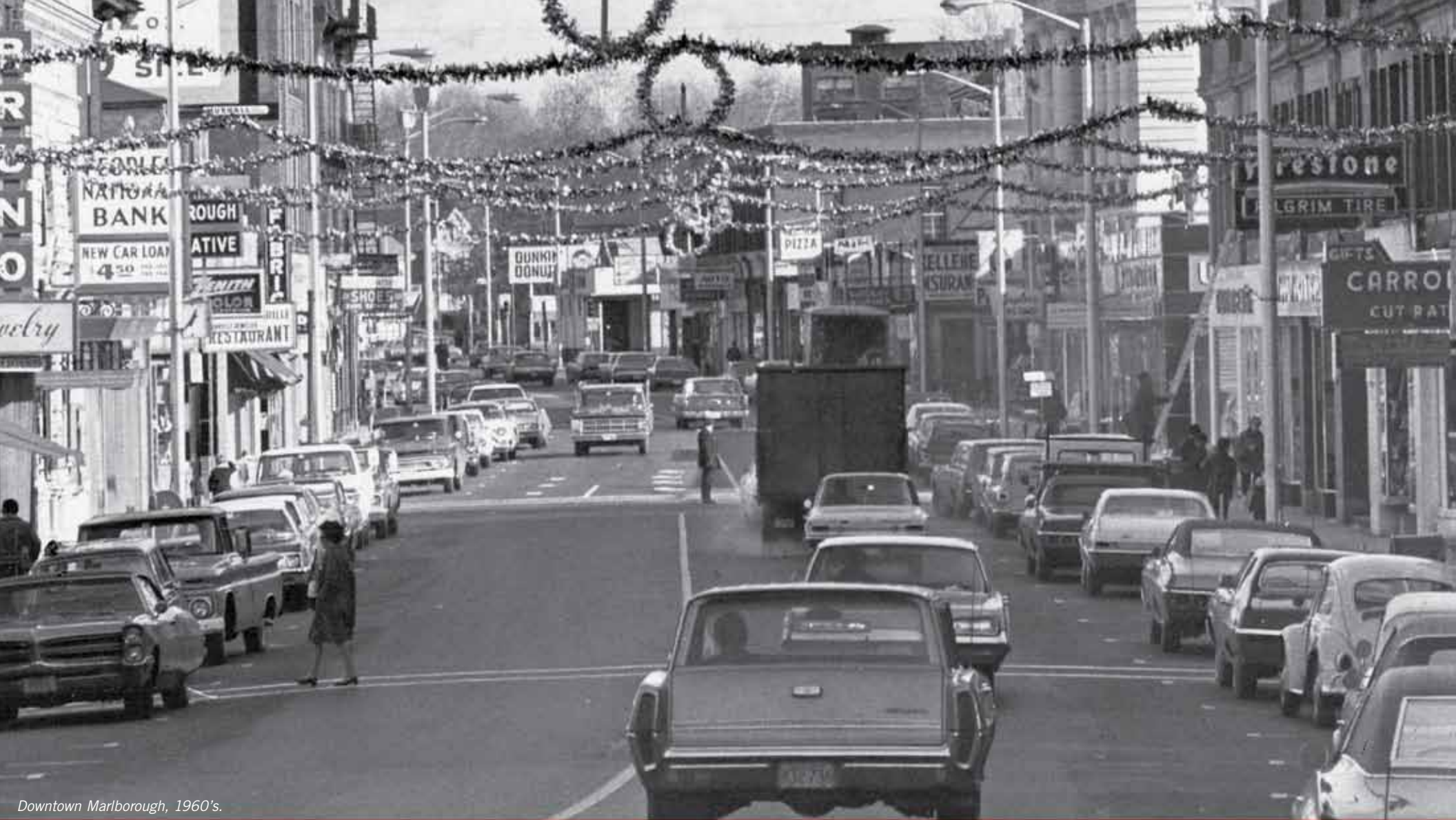
Downtown Marlborough, 1960's.