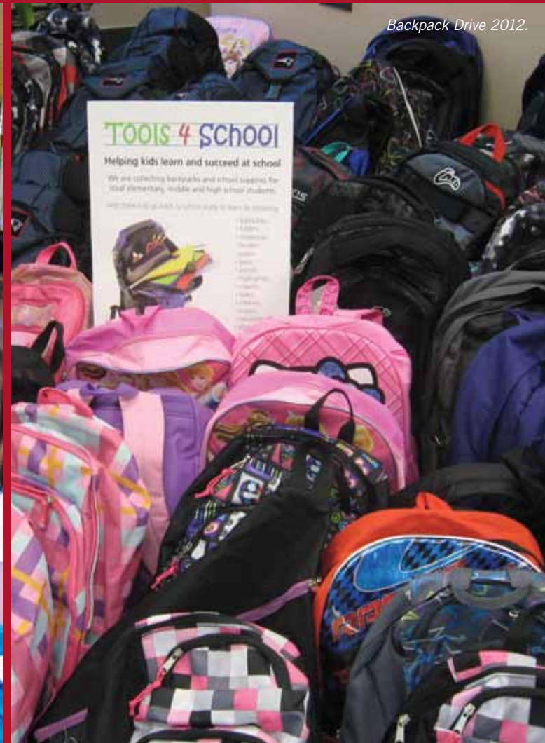
Backpack Drive 2012.