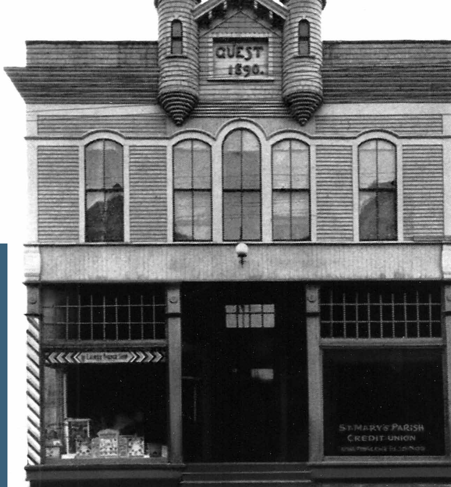
St. Mary's Parish Credit Union's office on the "Guest Block" circa 1926.