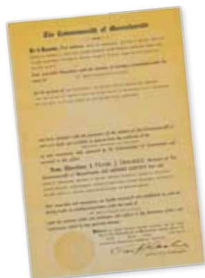
Original Charter from July 9, 1913.

The Credit Union operated out of St. Mary's Catholic Church's Parish Hall.