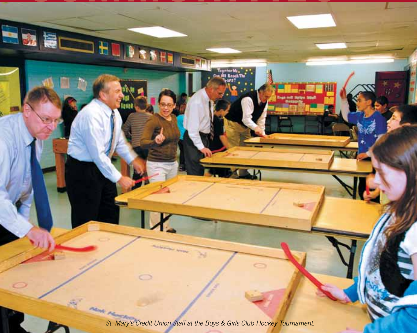
St. Mary's Credit Union Staff at the Boys & Girls Club Hockey Tournament.

When we opened our doors in 1913, we strived to put the needs of working people first. Yet, we have always believed that our responsibilities don't end there. In order to truly make life better for our members, we must support the communities where they live and work. That's why every year, in a variety of ways, St. Mary's continues to invest in our communities. Whether we're providing mortgages to help stabilize our neighborhoods, delivering loans to help fuel businesses and economic growth, or lending financial and volunteer support to community organizations, we're proud to make a difference.