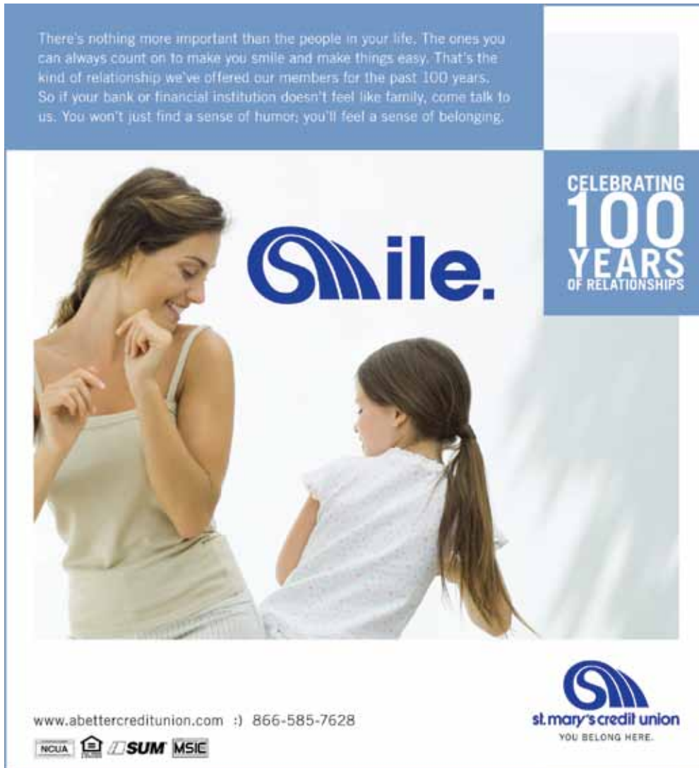
100th Anniversary "Relationships" Advertisement.

As we go to press with this commemorative book, many of these wheels of advancement are already in motion. Our new Westborough branch is on the verge of opening, extending our network and offering a more personal banking experience to a whole new array of individuals, families and businesses. We look forward to welcoming them to our family.